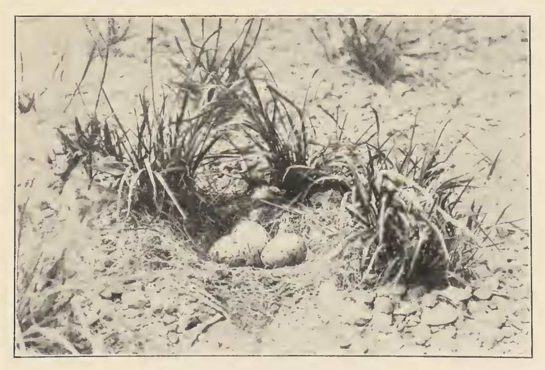
NEST OF CALIFORNIA GULL "There were perhaps forty nests . . , with only an occasional tuft of straggling grass to help hide them."